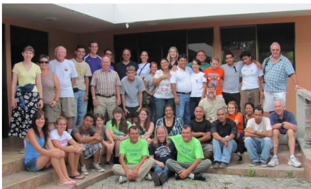
FPC Mission team members and Nicaraguan friends, 2011.

The vision for Global Missions is to engage all members of First Presbyterian Church to use their time, talent or treasure in serving God in order to meet physical, communal and spiritual needs of His people worldwide and demonstrate the fellowship and virtues of Christian life.