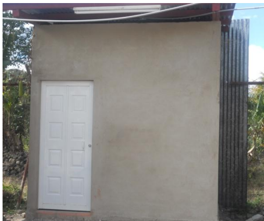
Restroom on the Church campus, 2011.